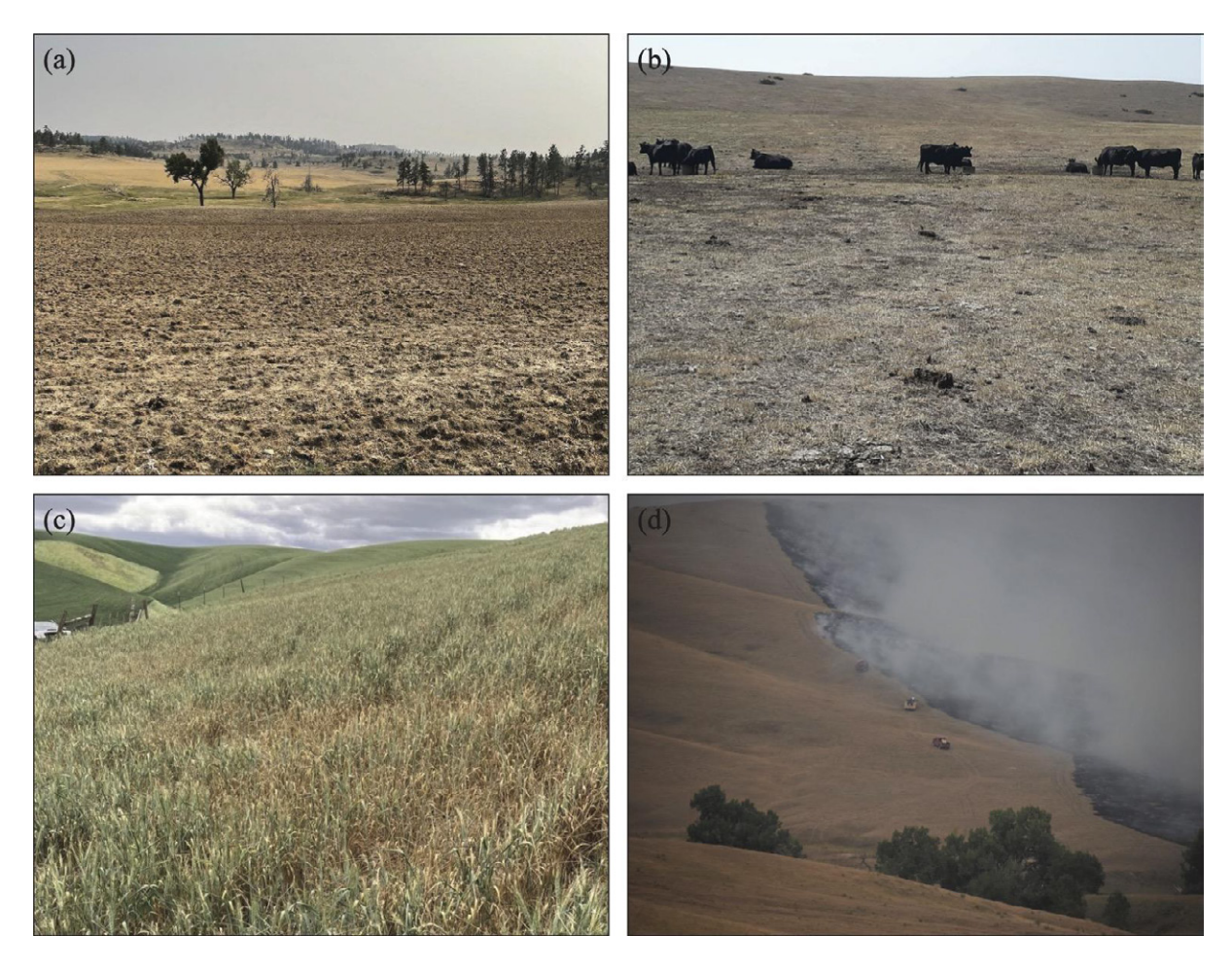
Fig. 1. Pictures showing the diverse impacts of flash drought during 2021, including (a) spring wheat in central Montana that did not have enough rain to germinate by 09 August, (b) heavily grazed pasture in central Montana on 07 September, (c) poor winter wheat heading in southeastern Washington on 21 May, and (d) a grassfire in central South Dakota on 02 August. All pictures were obtained from the Condition Monitoring Observer Report for Drought (CMOR-Drought) tool maintained by the National Drought Mitigation Center.

and the Canadian Prairies is another example: in the U.S., wildfires burned 4.8 million acres and caused agricultural losses in excess of $2.6 billion (Hoell et al. 2020). Record high temperatures and below-normal rainfall again caused flash drought to develop across parts of the northwestern and north-central U.S. during the spring and summer of 2021. This event led to a wide range of impacts such as lower crop yields, overgrazed pastures, and wildfires that led to poor air quality and ecological damage (Fig. 1).