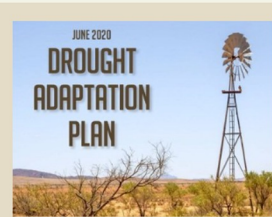
Oglala Sioux Tribe June 2020 drought adaptation plan prepared by the Great Plains Tribal Water Alliance