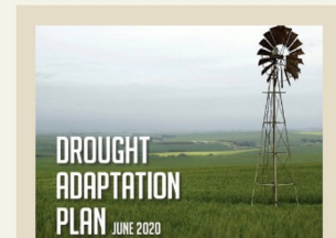
Flandreau Santee Sioux Tribe June 2020 drought adaptation plan prepared by FSST in collaboration with Great Plains Tribal Water Alliance