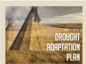
Rosebud Sioux Tribe October 2020 drought adaptation plan prepared by Great Plains Tribal Water Alliance