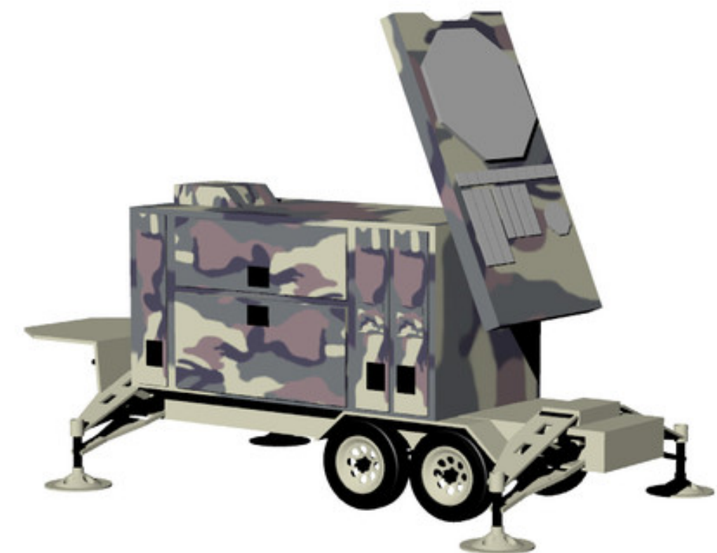
MPQ-53 C-Band System