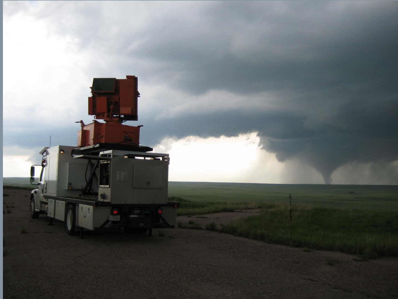
MWR-05XP Deployed on the Goshen WY Tornado during Vortex 2

To transition various DOD radar systems technology to develop an advanced, mobile scientific instrument for atmospheric research