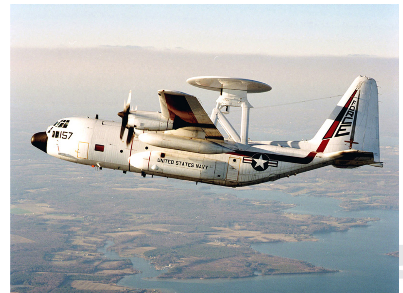
AWACS C-130 Version

SPY-1 S-Band System – Antenna being removed from a ship. These systems or subsystems are available to DOD through a transfer process.