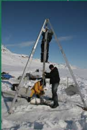
Billy D'Andrea, Alumni Class 18

For additional information on this program and instructions on how to apply, please visit: vsp.ucar.edu/cgc . For further information, call (303) 497-1605 or e-mail vspapply@ucar.edu .