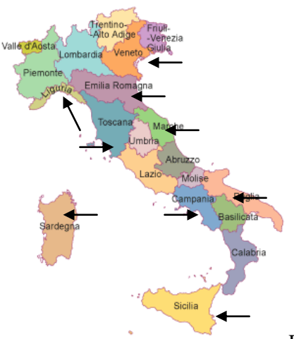
Figure 1. Areas involved in the study

All the isolated strains were also characterized serologically using the standard protocol suggested by the supplier.